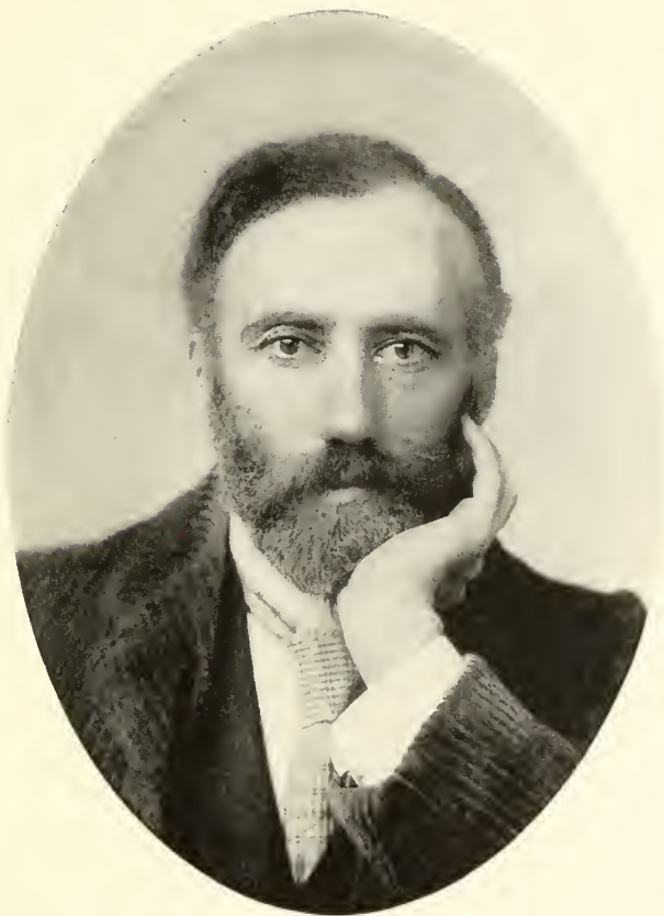
WILLIAM QUAN JUDGE SUCCESSOR TO H. P. BLAVATSKY